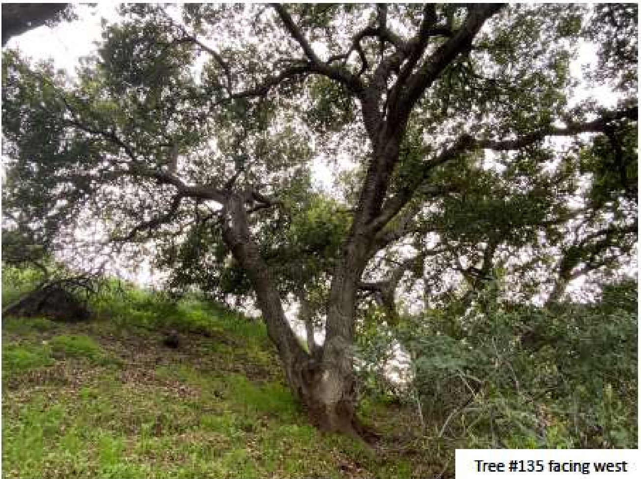
Tree #135 facing west