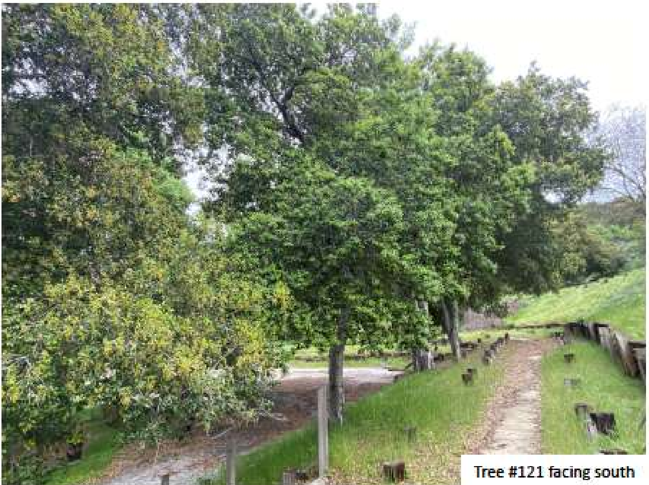
Tree #121 facing south