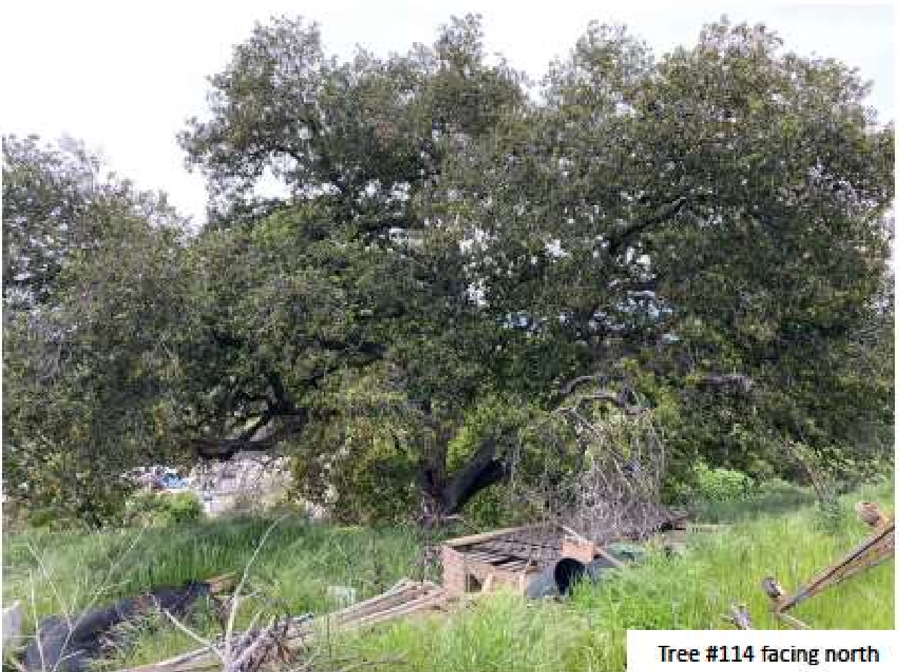
Tree #114 facing north