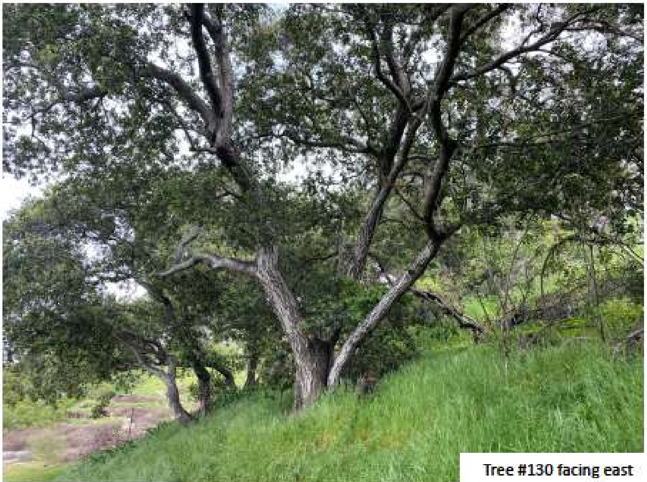
Tree #130 facing east