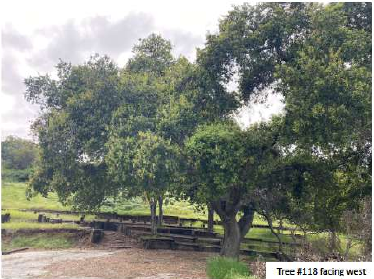
Tree #118 facing west