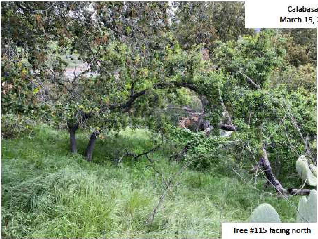
Tree #115 facing north