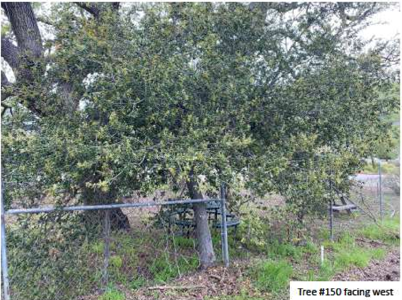
Tree #150 facing west