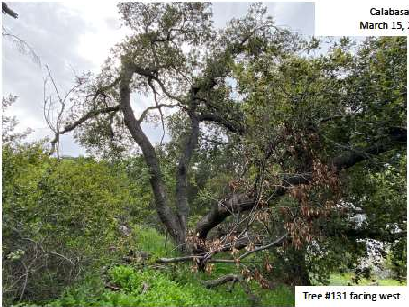
Tree #131 facing west