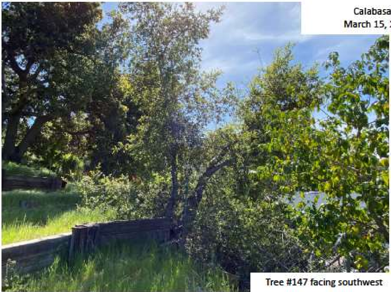
Tree #147 facing southwest