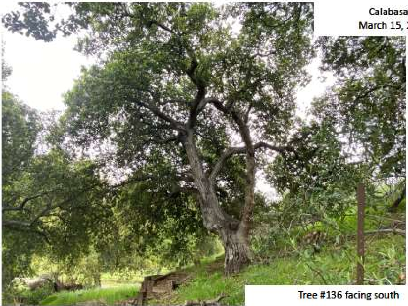
Tree #136 facing south