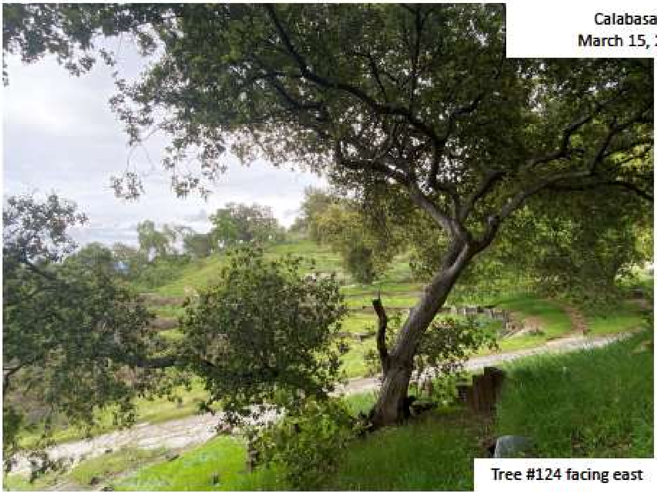
Tree #124 facing east