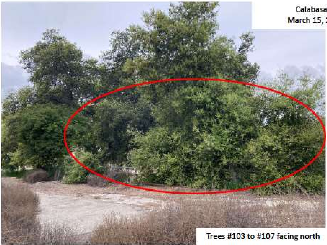
Trees #103 to #107 facing north