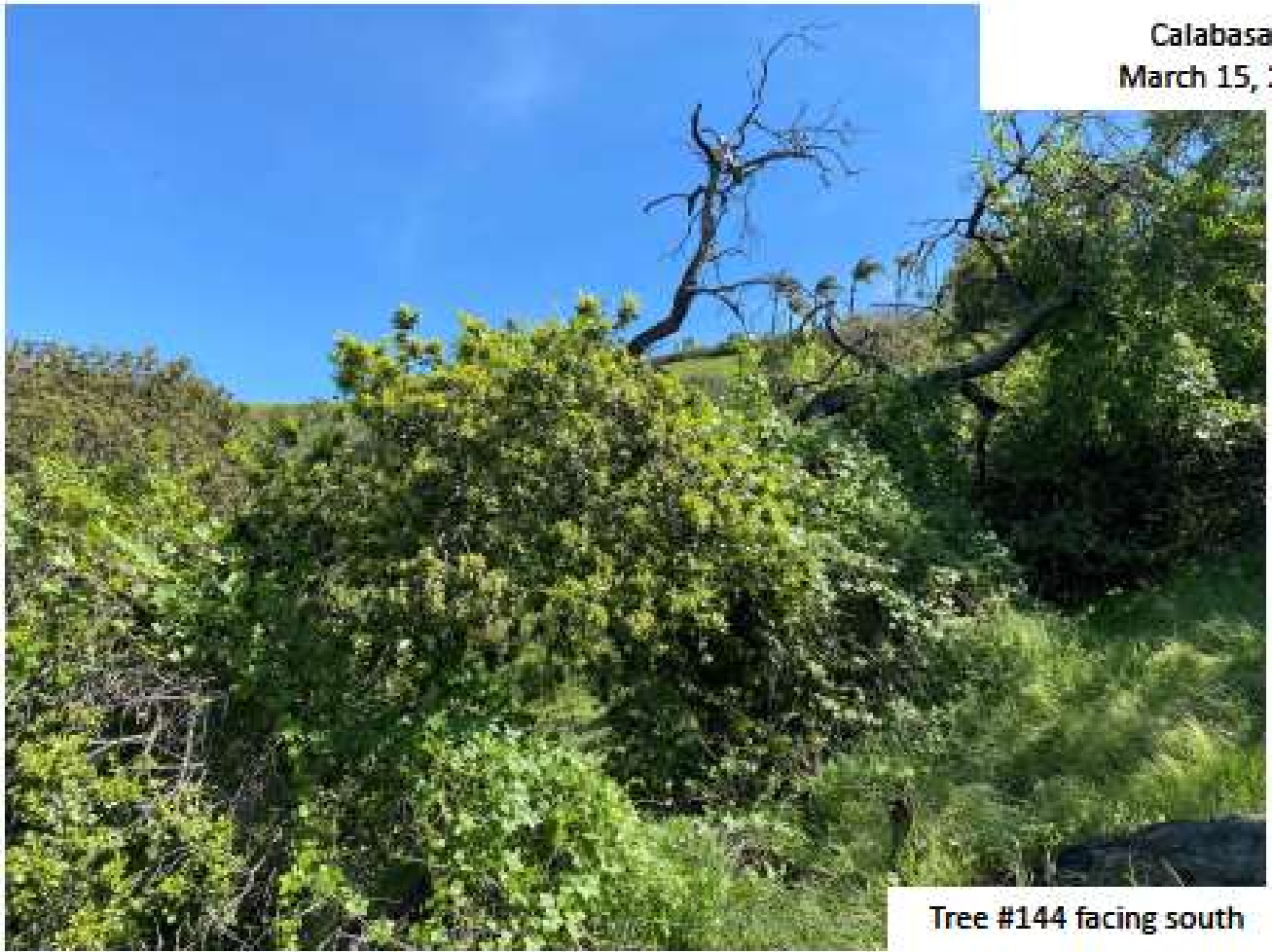
Tree #144 facing south