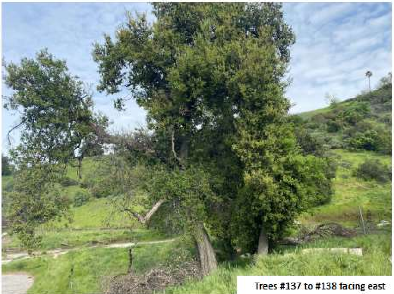
Trees #137 to #138 facing east