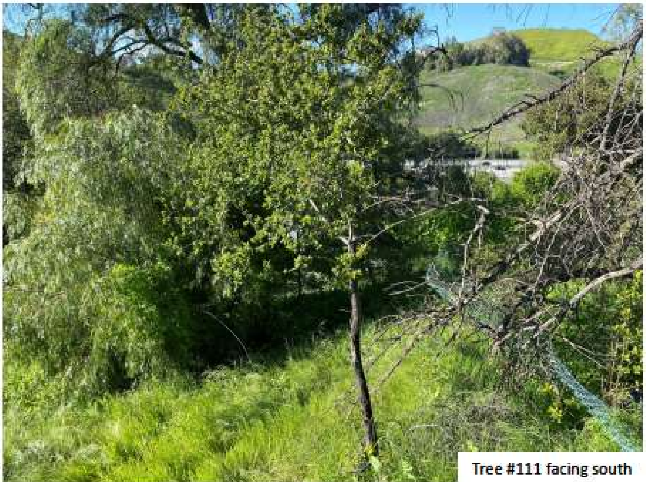
Tree #111 facing south