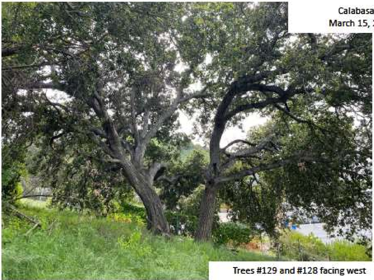
Trees #129 and #128 facing west