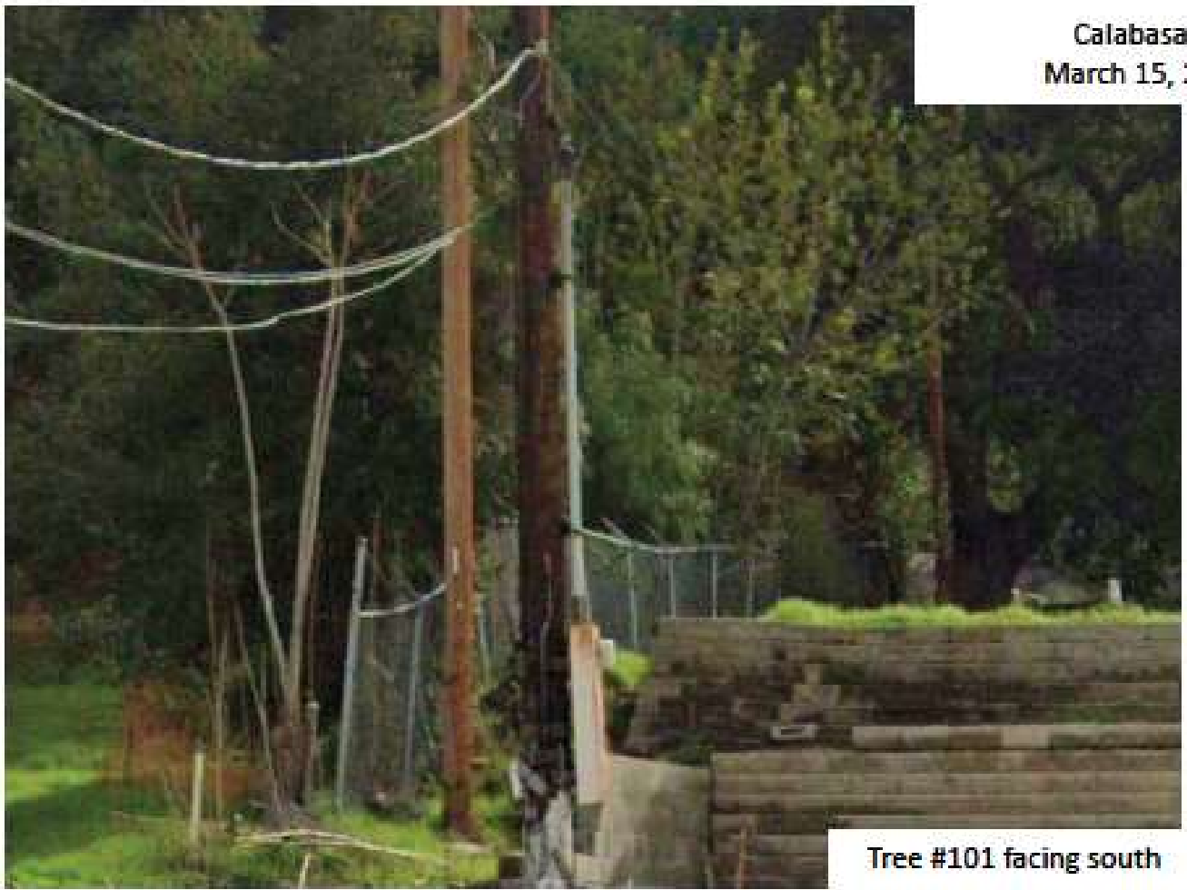
Tree #101 facing south