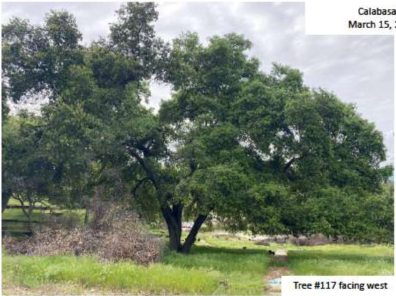
Tree #117 facing west