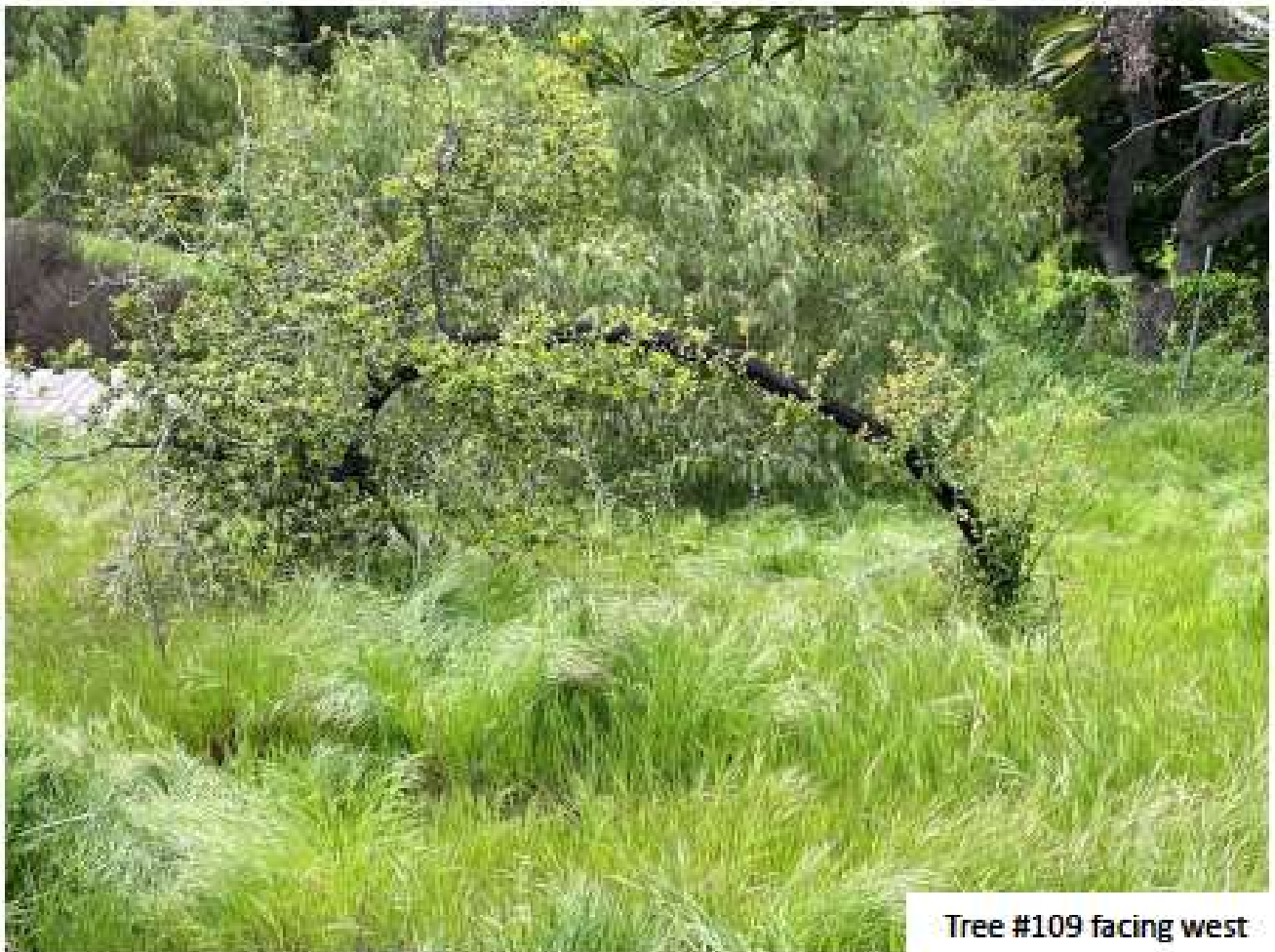
Tree #109 facing west