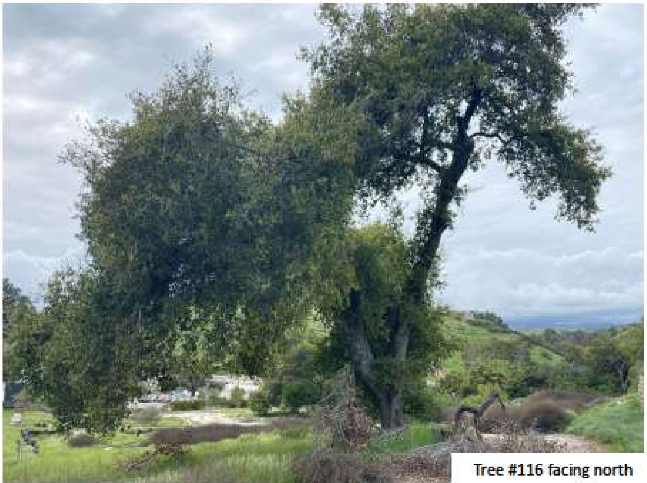
Tree #116 facing north