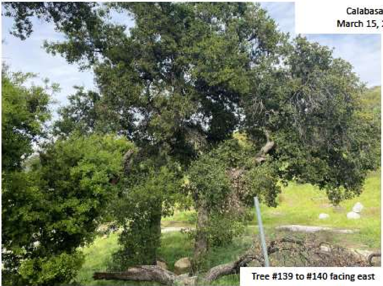
Tree #139 to #140 facing east