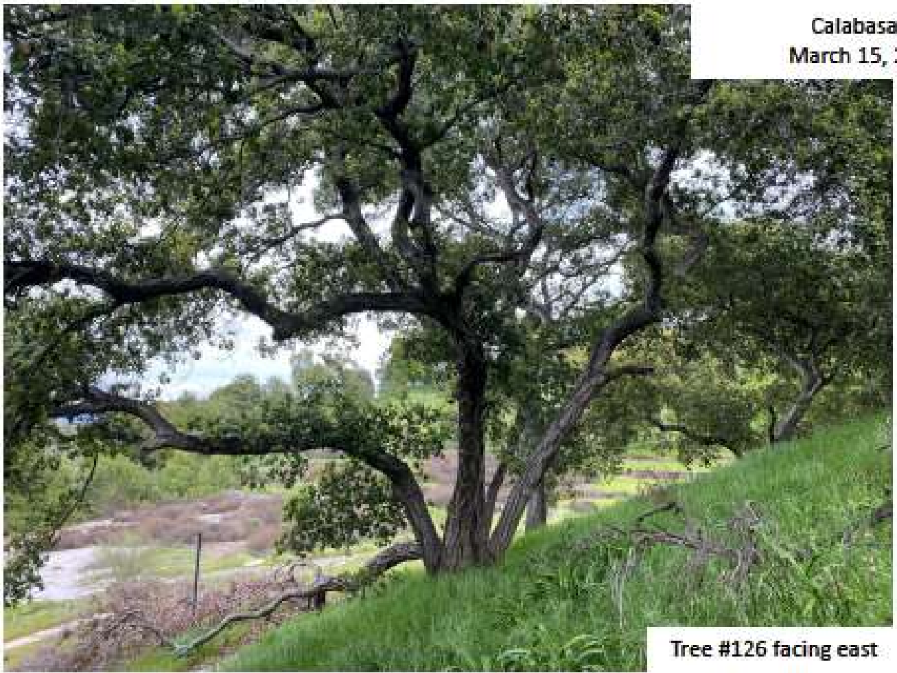
Tree #126 facing east