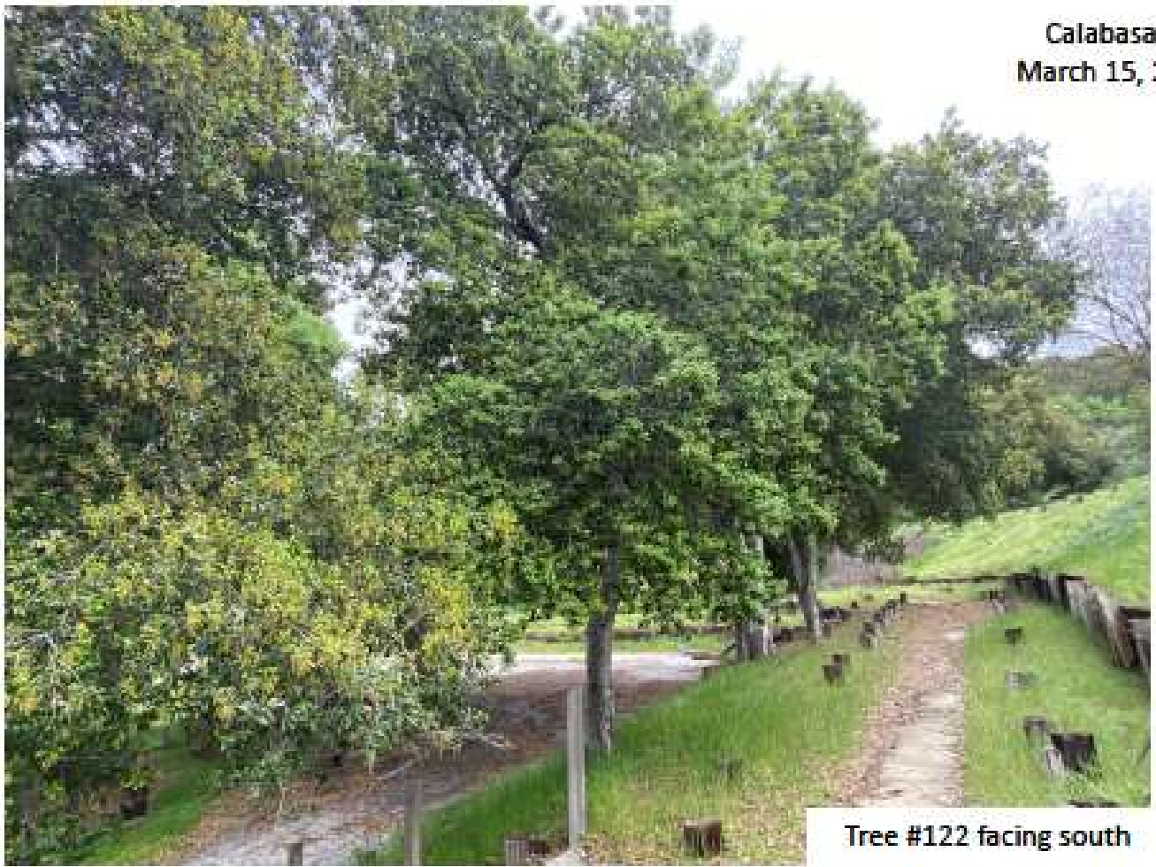
Tree #122 facing south