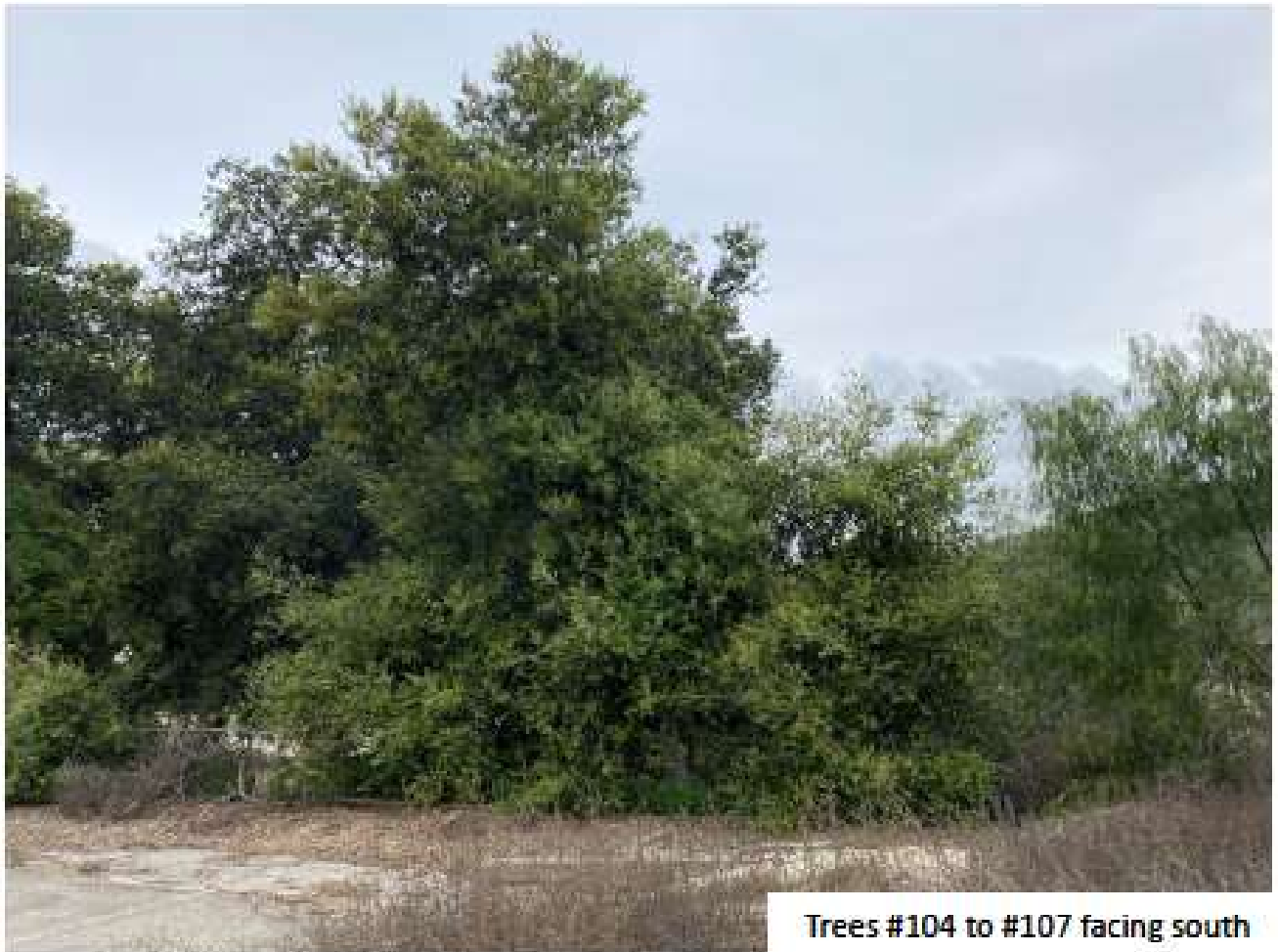
Trees #104 to #107 facing south