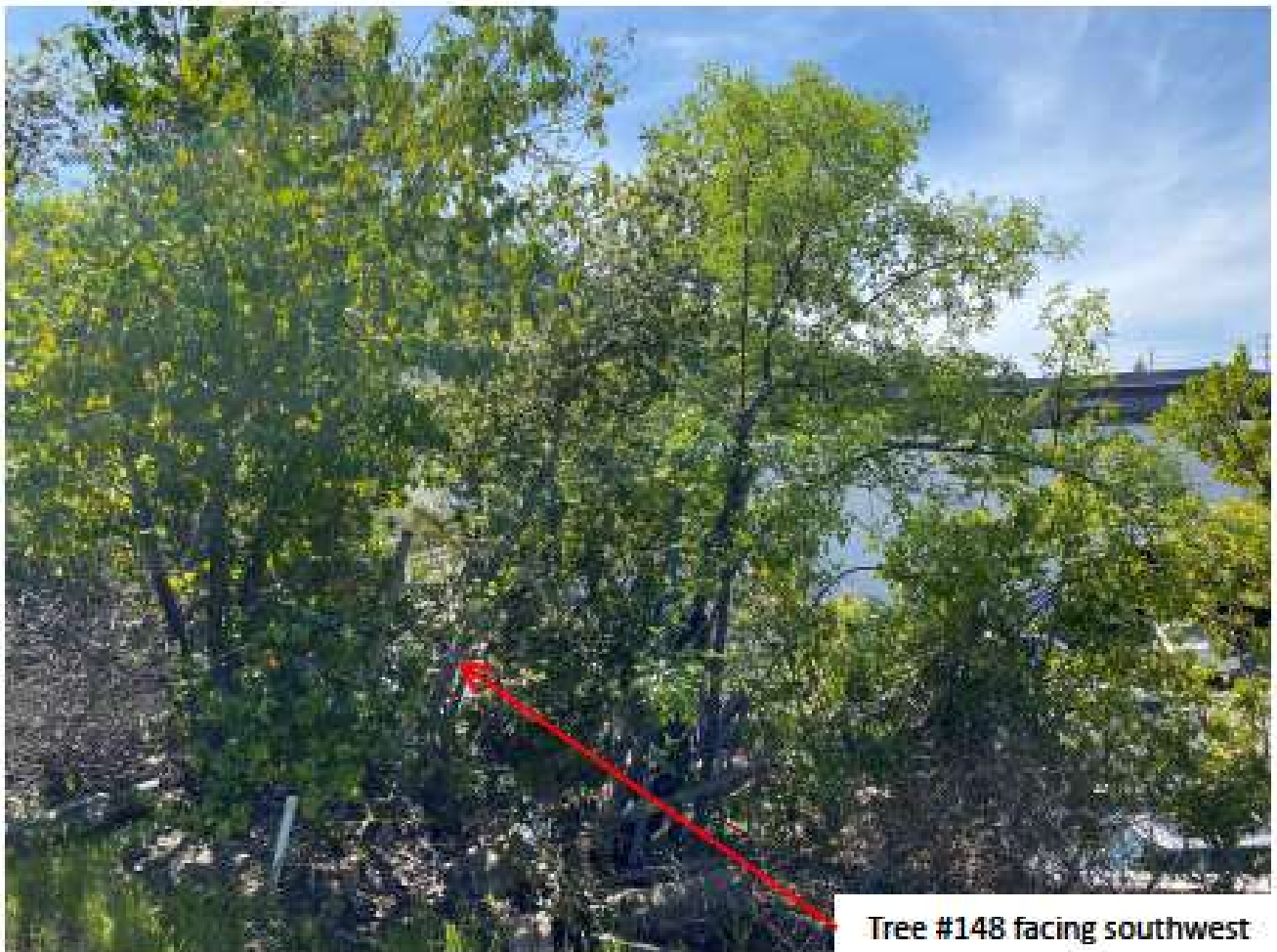
Tree #148 facing southwest