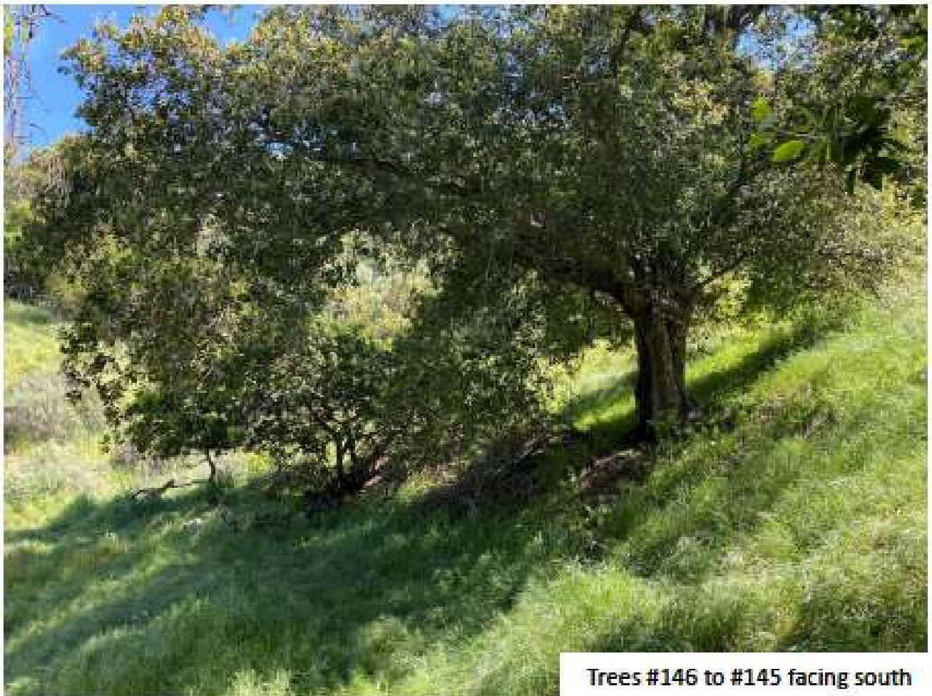
Trees #146 to #145 facing south