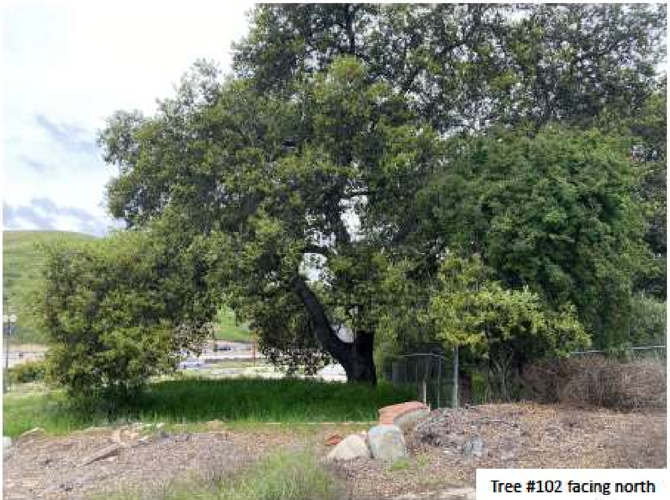
Tree #102 facing north