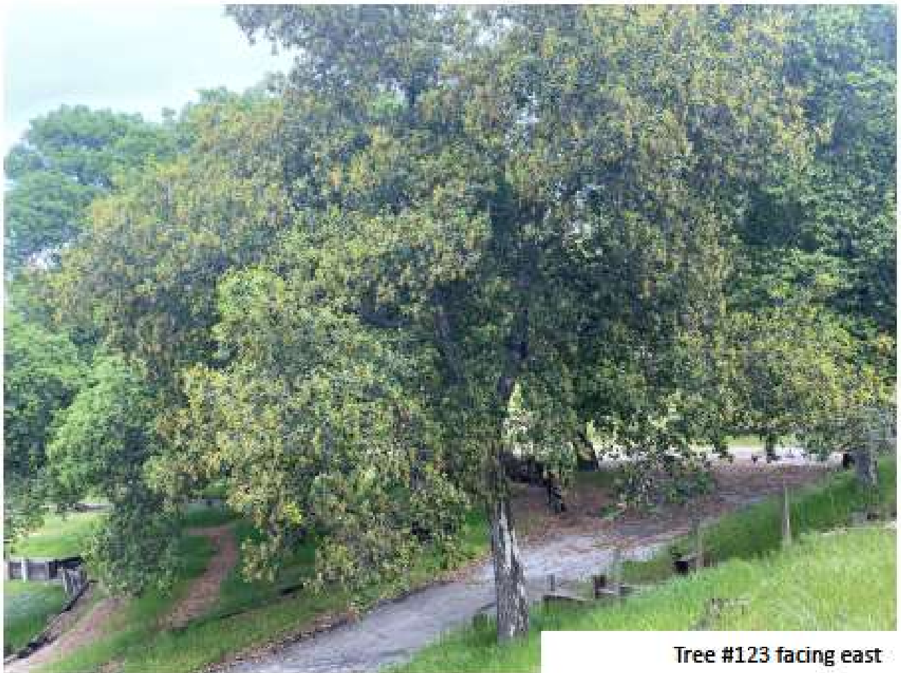
Tree #123 facing east