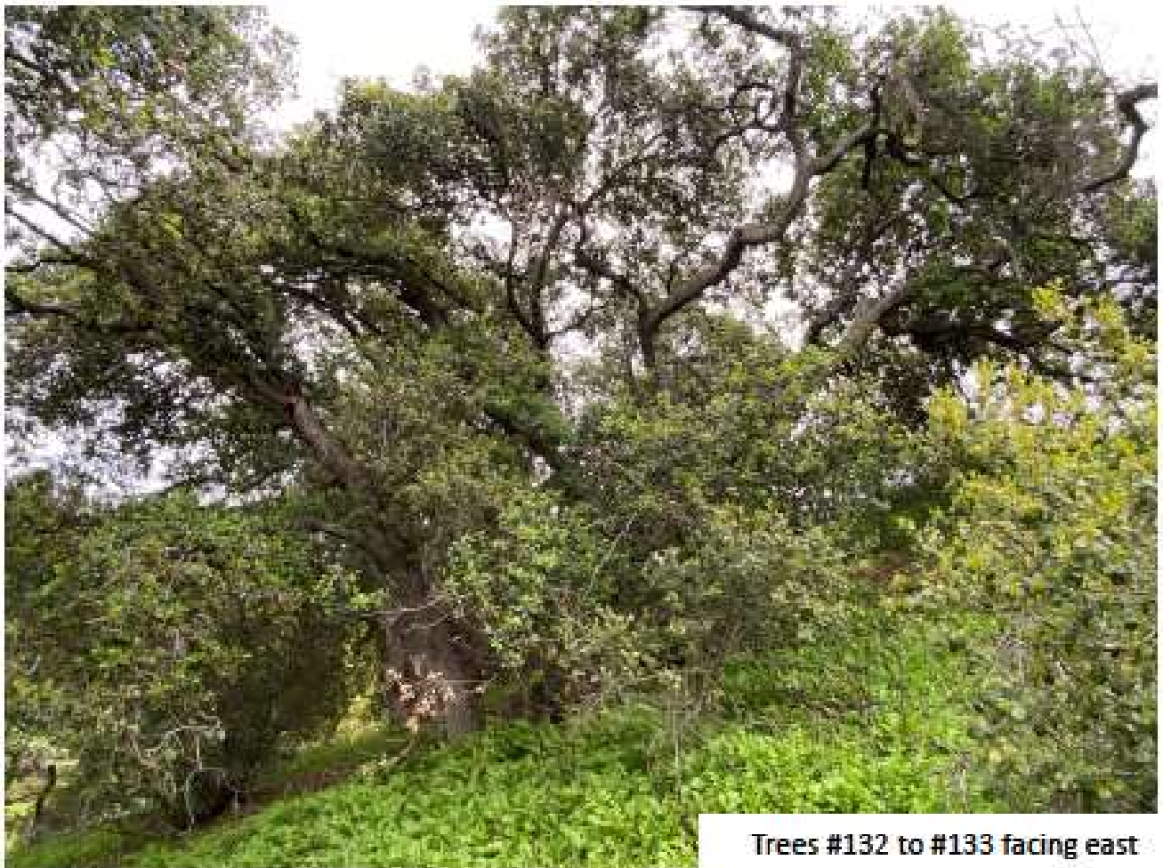
Trees #132 to #133 facing east