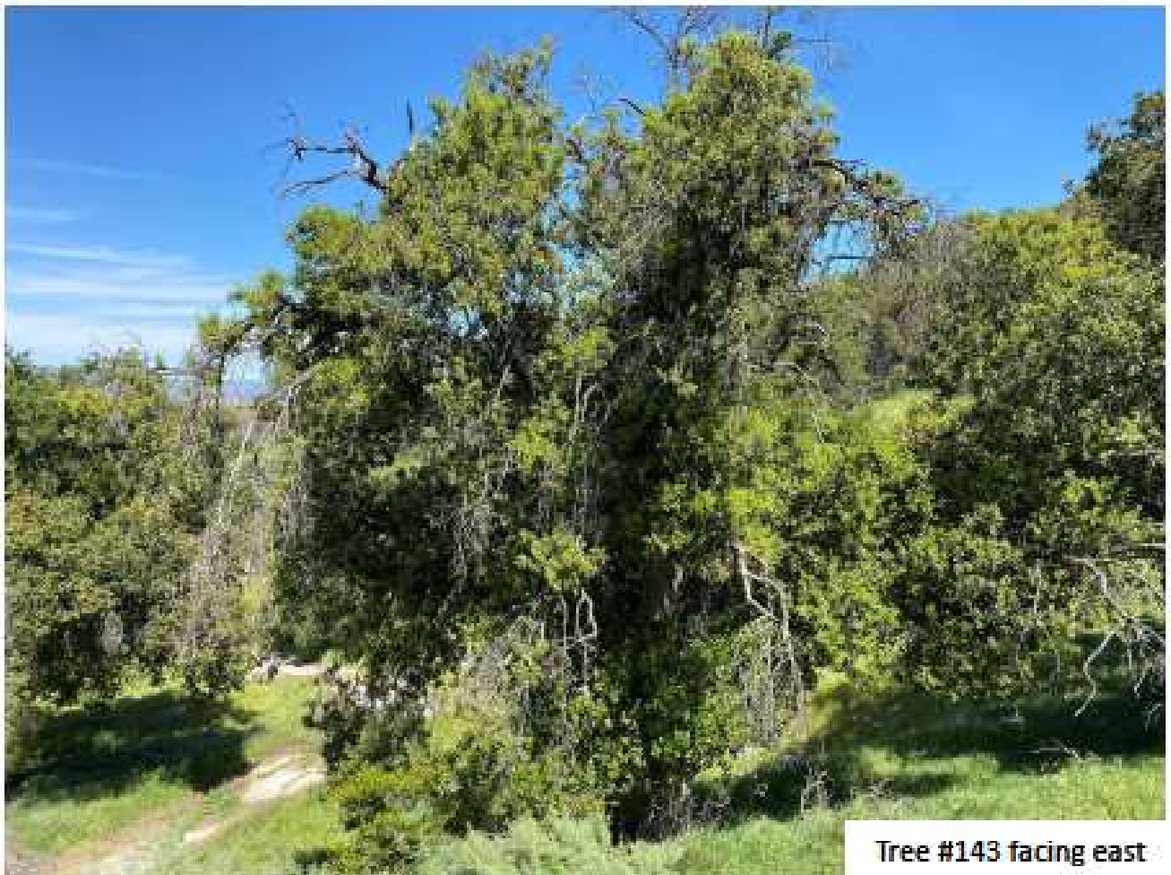
Tree #143 facing east