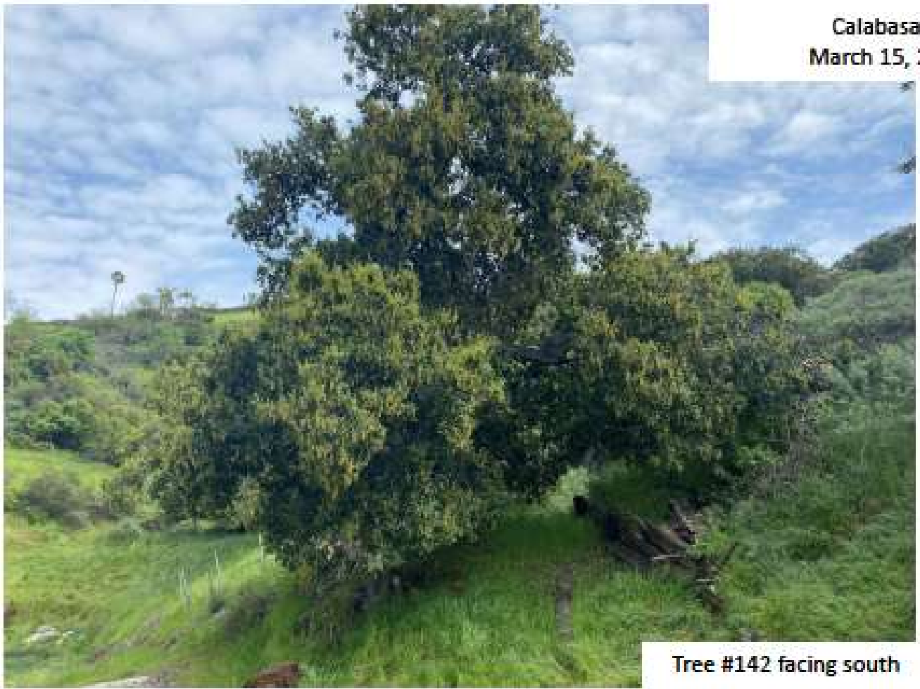
Tree #142 facing south