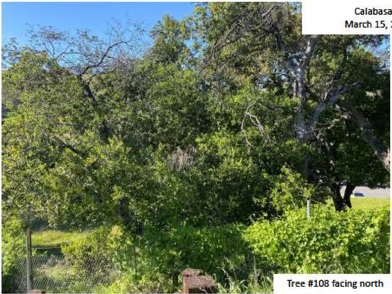
Tree #108 facing north