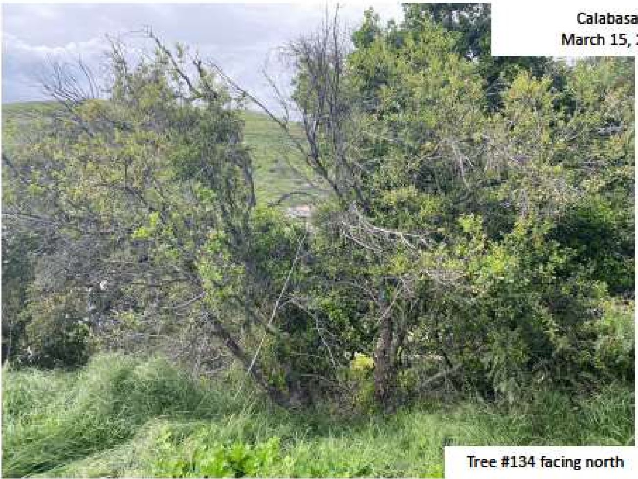
Tree #134 facing north