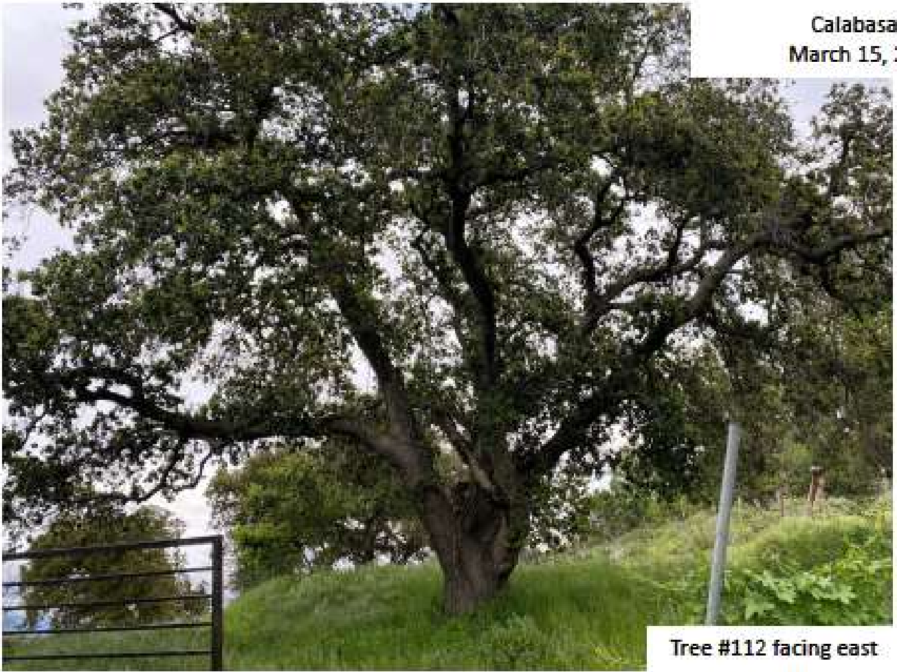
Tree #112 facing east