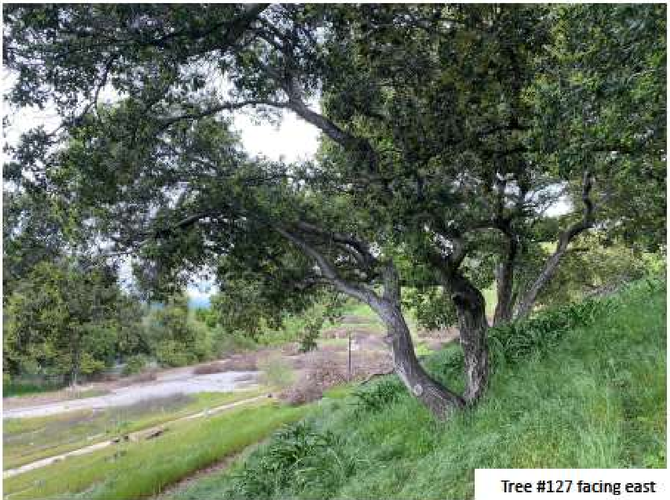
Tree #127 facing east