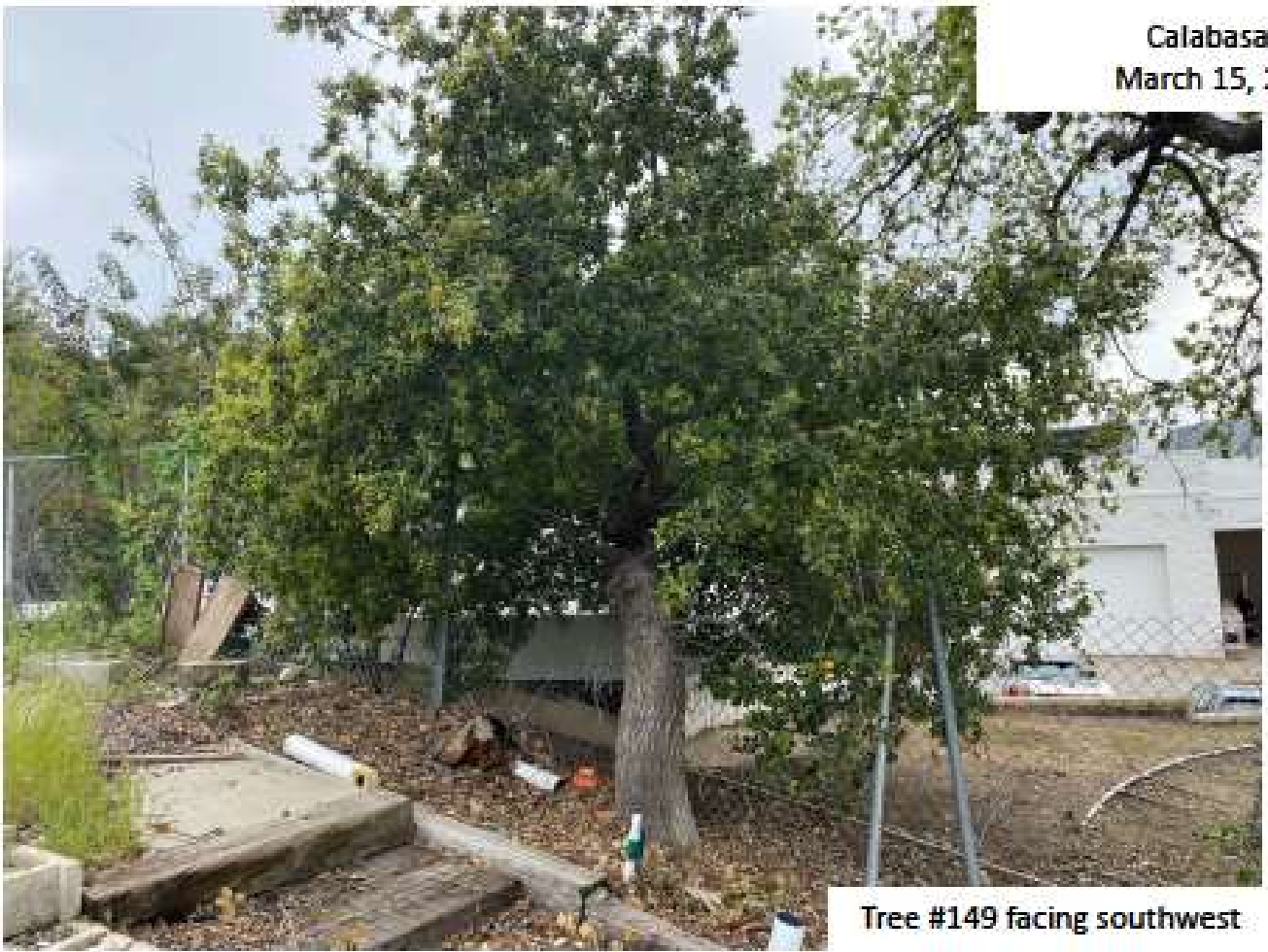
Tree #149 facing southwest