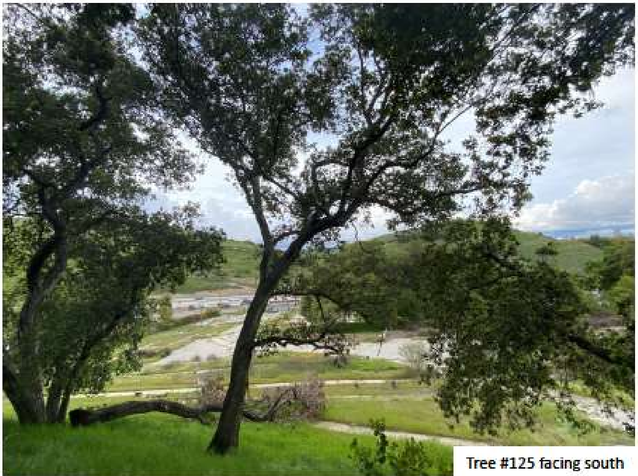
Tree #125 facing south