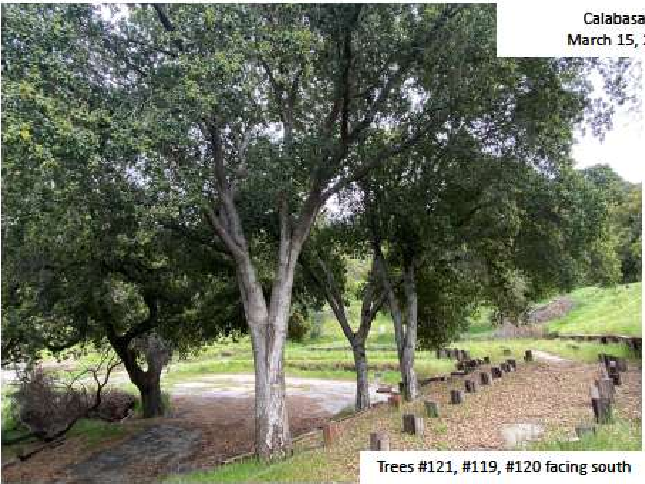
Trees #121, #119, #120 facing south