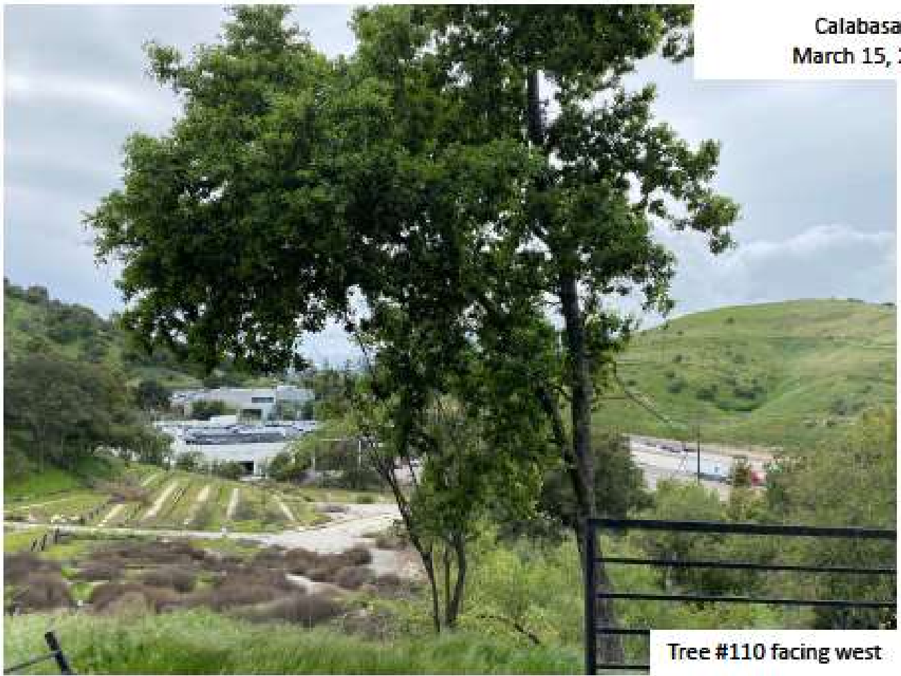
Tree #110 facing west