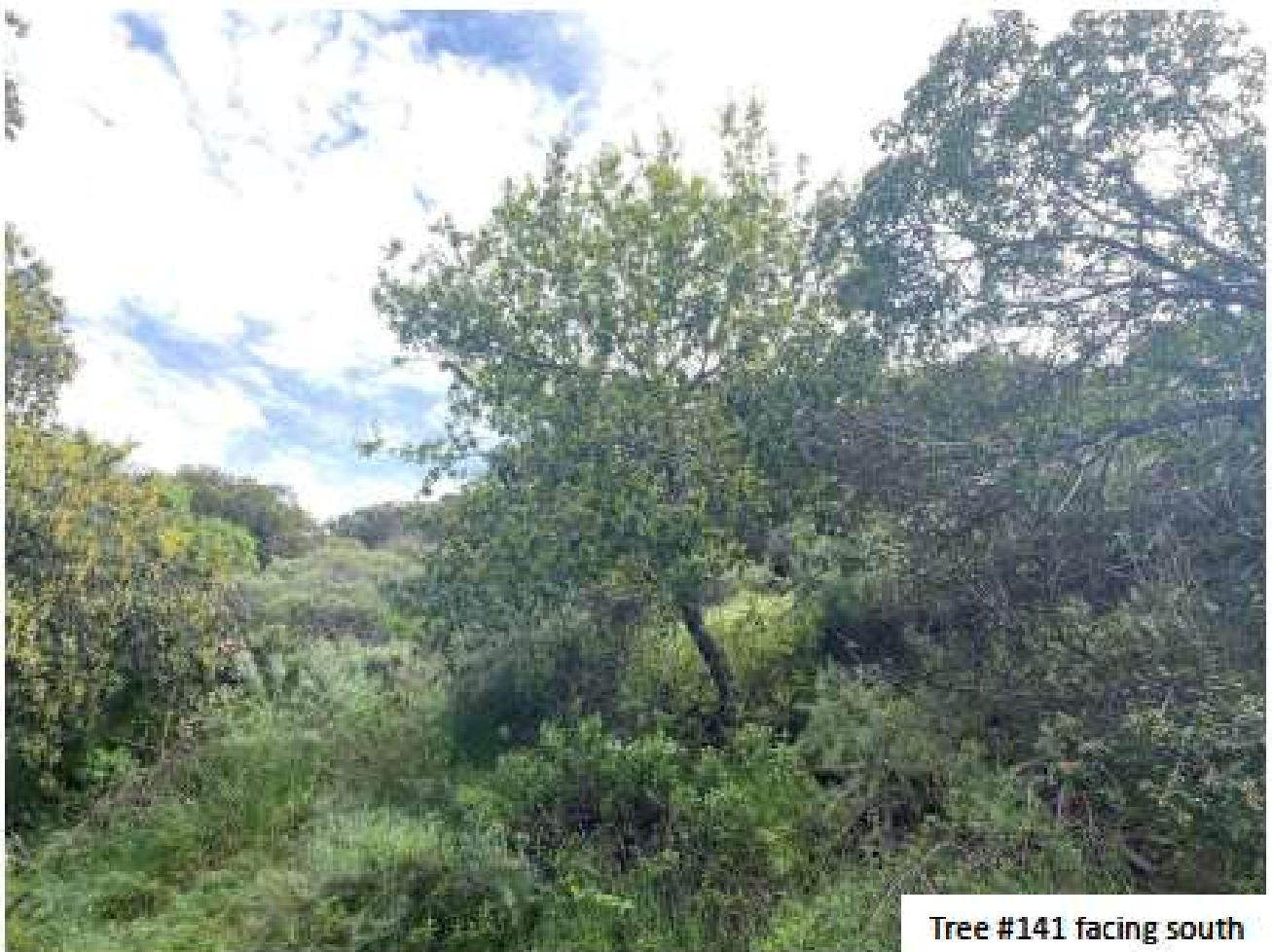
Tree #141 facing south